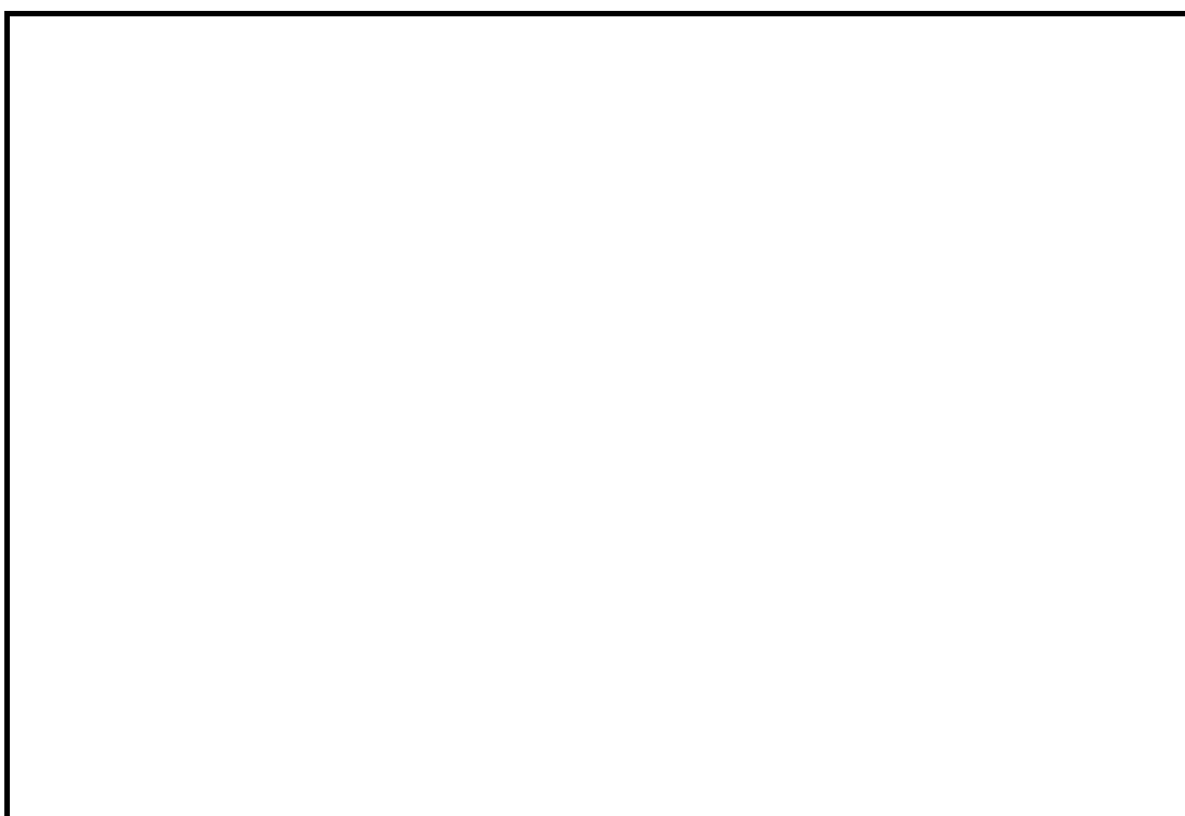
Officers from the Police Mobile Brigade (Brimob) march during a parade in Jakarta on 1 July 2002.

Despite the arrest of this group of alleged suspects on the day of the Wondiboi attack, Brimob continued to detain and torture others, targeting specific individuals as well as carrying out what appear to be indiscriminate arrests. Members of the DPMA, village heads and school teachers were publicly blamed for participating in or instigating the attack and arrested. Others, including members of their immediate families and clans, neighbours and associates, were also detained. Many of those held were reported to have been subjected to torture and other forms